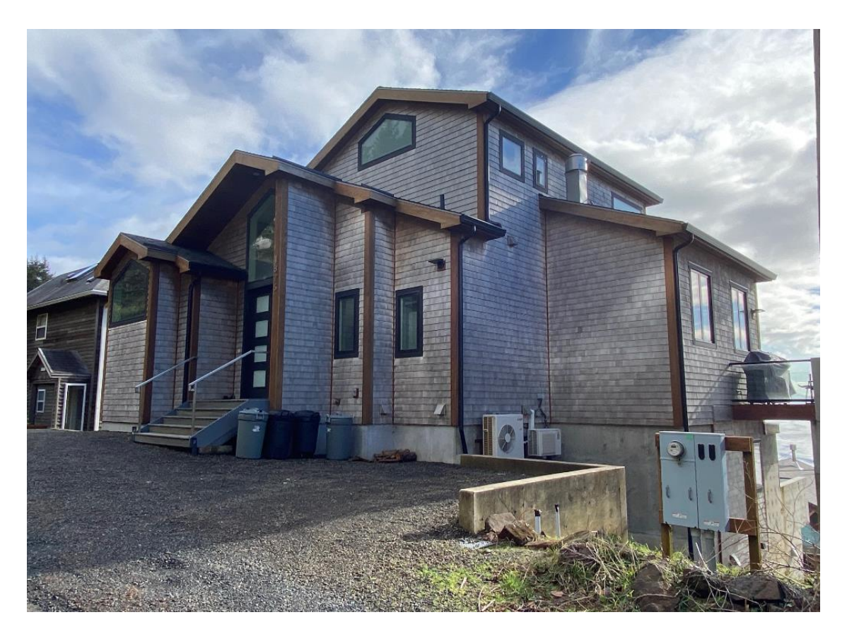
Exhibit 1A: Uphill side

The uphill side of this relatively recent home on a sloped lot in Oceanside features a <u>high number</u> of nooks and pop-outs on the uphill side compared to the downhill side with the result that there are many more short "walls" than tall "walls." When all walls are averaged, this technique skews the average downward, which in turn inflates maximum allowed height. Combined with a shallow roof, this design accommodates a 5-story structure. The top four stories encompass a 4-bedroom unit / 4-bath short term rental that sleeps 10 people, while the bottom story houses a rental apartment.