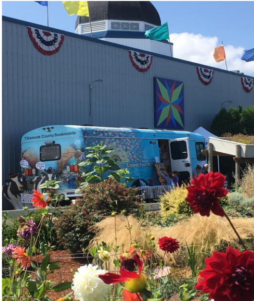
The Bookmobile at the County Fair