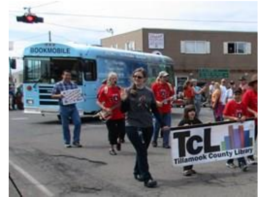
The Bookmobile in the Dory Days Parade