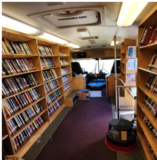
A peek inside the Bookmobile