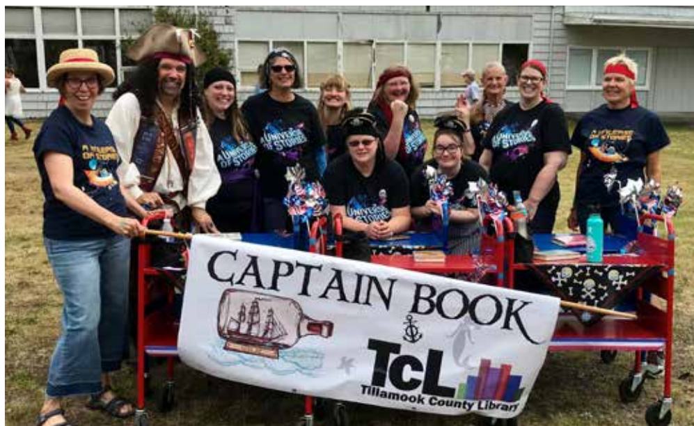
Our book cart drill team appeared in four summer parades!