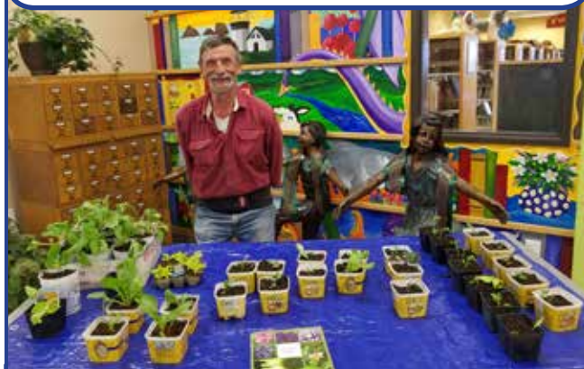
Generously growing and sharing the bounty!

A partnership with: Oregon Food Bank, Food Roots and OSU Extension.