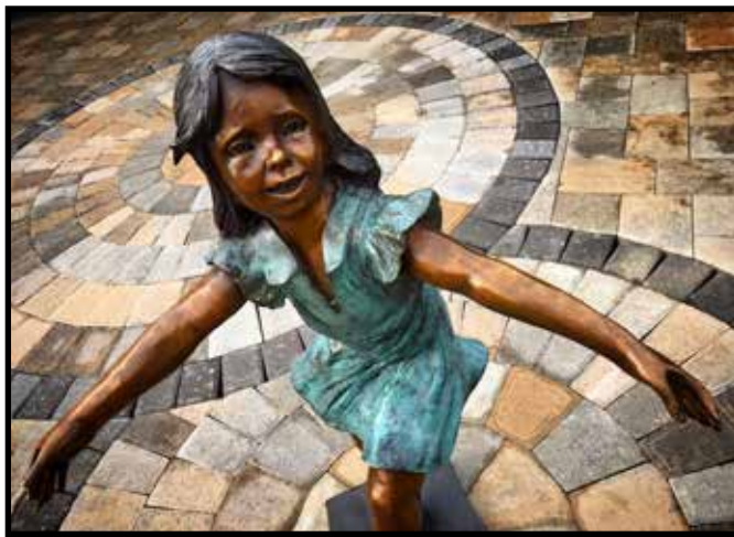
Pictured above is one of the three dancing children statues to be placed in the park.