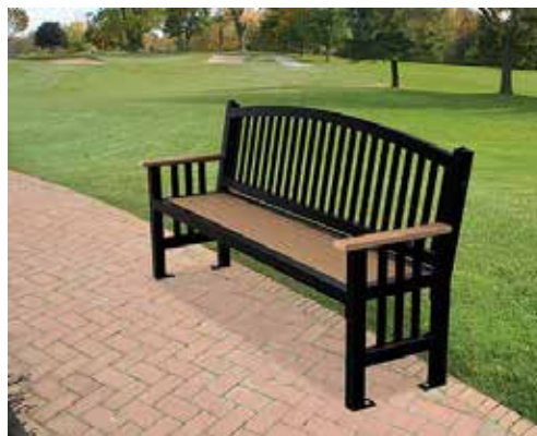
A sample of the arched back bench available for purchase.

With Phase 1 well underway, the Foundation Board is looking ahead to Phase 2, the north end of the park. This portion of the park includes a platform stage and a large area for audiences and gatherings. An unsolicited grant of $5000 from the Stepp Family Trust in Manzanita is providing a jump-start to this next phase.