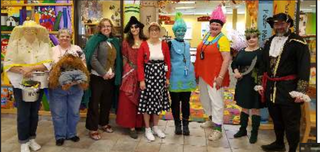
Peek-A-Boo in the kids room!