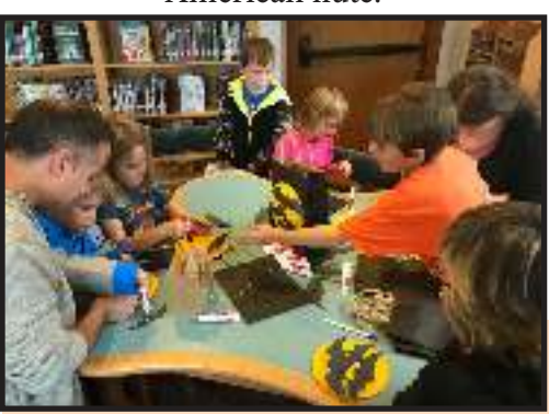
A Halloween craft in Pacific City.