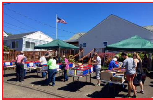
The Rockaway Beach Library is much-loved and heavily used by the community.

It took a few years, but the "new" library opened in partnership with the Tillamook County Library on