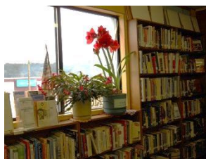
This lovely amaryllis, named Spike, adds beauty to the Garibaldi Library.

Each summer since 2005 the Garibaldi Branch has partnered with the Garibaldi Dairy Queen for a Summer Teen Reading Program. Teens read during the summer and are rewarded with ice cream. During the economic downturn in 2008, we partnered with the Garibaldi Lions Club and started an Adult Holiday Read to keep spirits up during the holiday season. The Garibaldi Librarian greatly appreciates this support for these continuing programs.