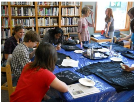
Teens paint glow in the dark t-shirts at this creative summer reading activity at the Pacific City Library.