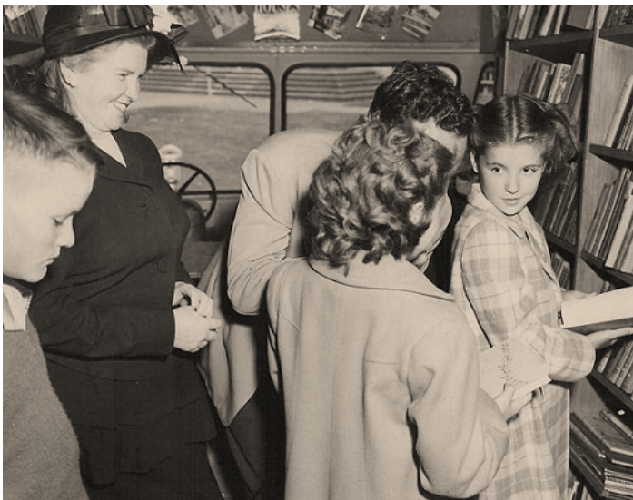
Library patrons make use of the bookmobile on its first day of service. July 2, 1948

Today anyone in Tillamook County with a library card can walk to their nearest library branch (or bookmobile stop) and access a multitude of books, movies, music, newspapers and magazines. In fact, with the continuing development of our online database collection, citizens of Tillamook County do not even have to leave their homes to enjoy the benefits of exceptional library resources.