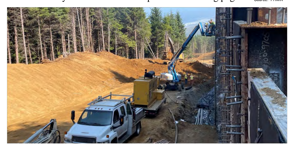
View of headed shear stud welding at the soldier pile wall.

Current road closure points will remain in effect on Bayocean Road near the Cape Meares Lighthouse, and approximately 0.5 miles south of the Lighthouse. Construction will have minimal impact on public traffic as it is closed to through traffic. Please be advised that project limits are now designated by barricades on Cape Meares Loop coming south from Bayocean Road. See map on the following page.